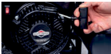
Recoil starting system