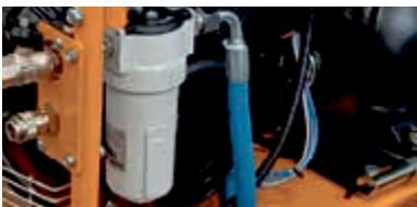
Condensate drain filter