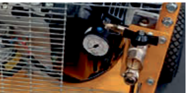
Ball Valve and Quick Connector