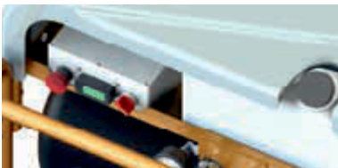
Compressor on/off selector